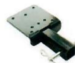
WARN Winch Hitch Adapter Mounting Plate — Model# 68531