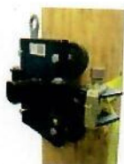
Portable Winch Tree/Pole Mount — For Portable Capstan Winch, Model# PCA-1263